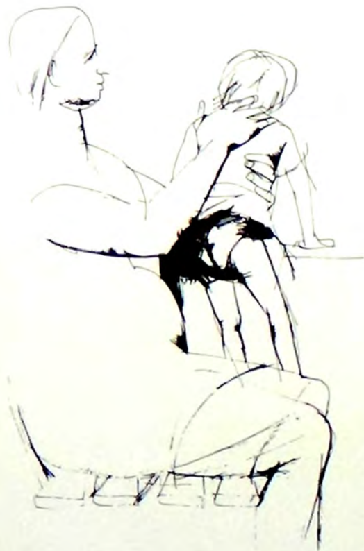
"Mother & Child" Pen & Ink 10" x 14"