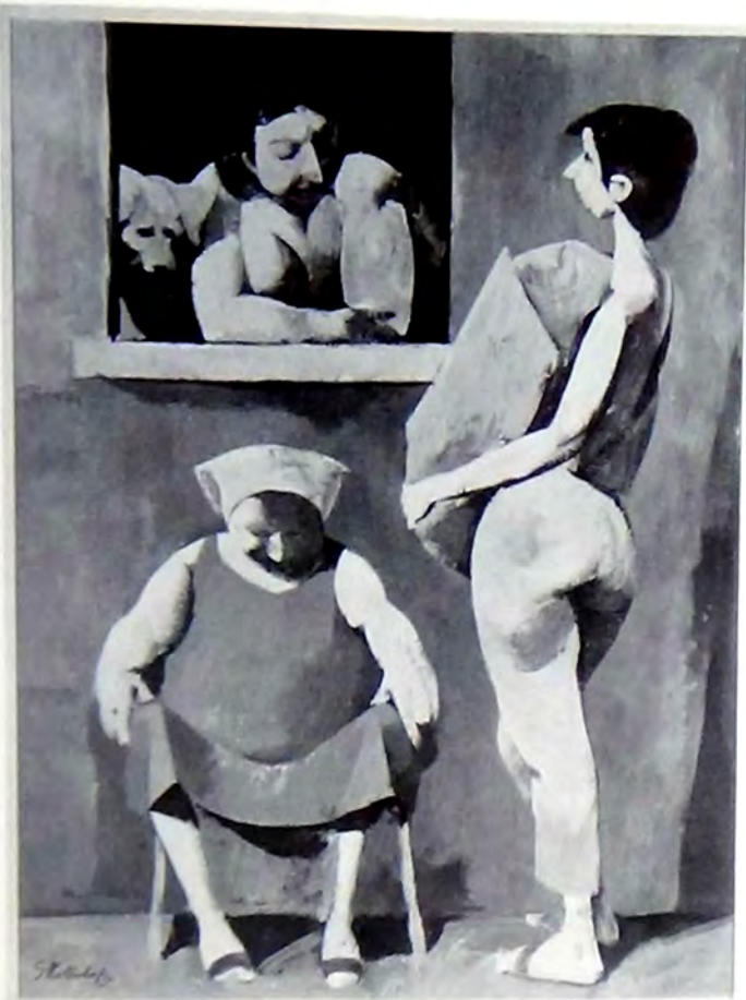
"In front of the House." Casein 35" x 26"