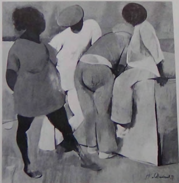
"Woman in Violet and three others."