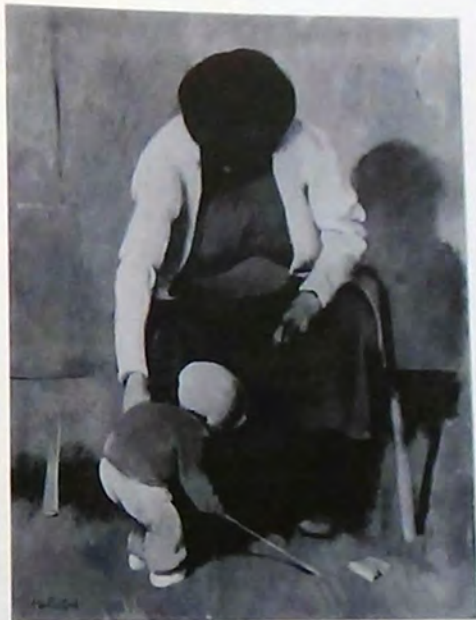
"Old woman and child"