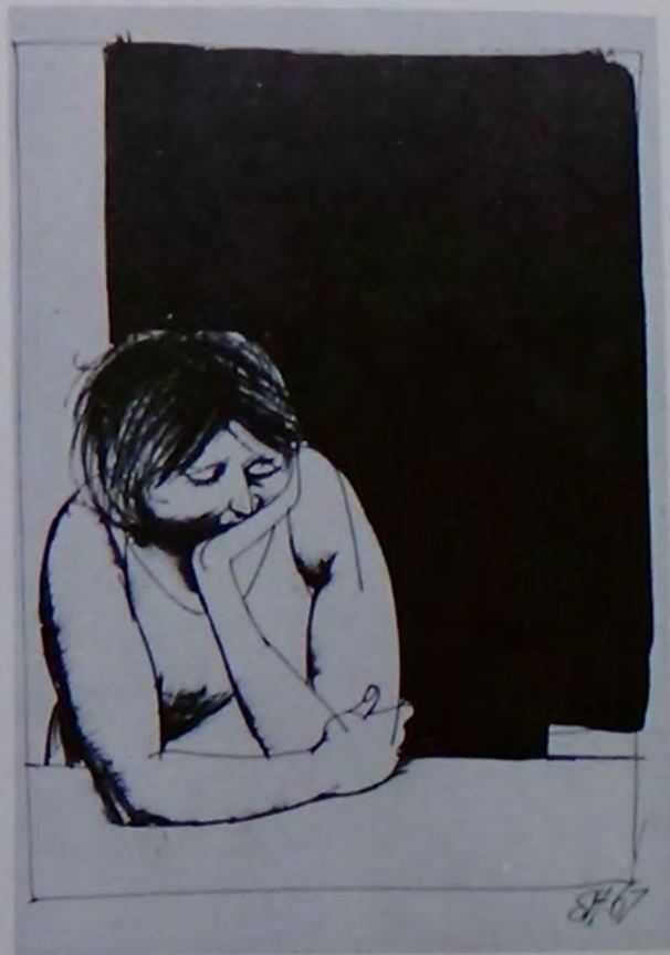
"At the window" Pen & Ink 9" x 12"