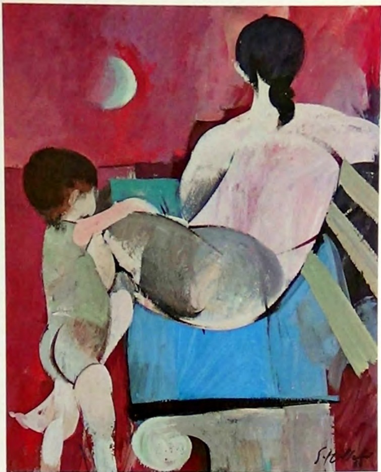
"Woman, Moon and Child" Casein 19" x 23"